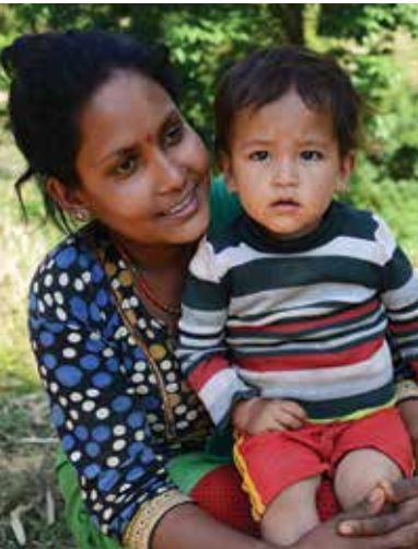
In Nepal, this mother and child had access to medicine after the earthquake because of AmeriCares disaster readiness.

Over the years, Medtronic has donated more than $78 million in medical products to AmeriCares.