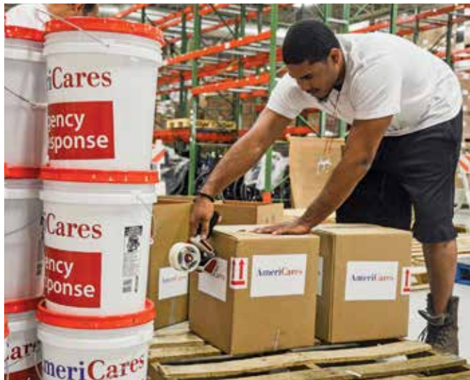
Buckets of relief and cleaning supplies went to flood victims in Illinois and Missouri.