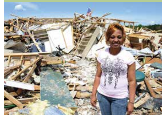
South Sudanese refugees carry basins after collecting water from a tap at the Tzaipi refugee camp in Adjumani, Uganda (top). A displaced boy from South Sudan holds his schoolbooks at Oliji primary school in northern Uganda (above). AmeriCares staff meet a health worker at the site of a Mississippi clinic destroyed by tornadoes (right).