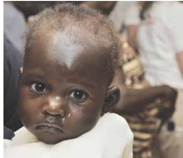
This malnourished child just arrived at a home for orphans.

What's growing here — knowledge and healthy children — will benefit generations to come.