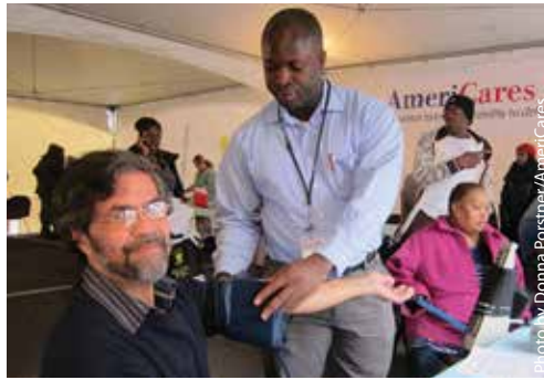
ING's support ensures AmeriCares is ready to respond.

For more than 10 years, ING U.S., its employees and the ING Foundation have contributed to AmeriCares, with a special emphasis on funding emergency response and preparedness. Last year, ING Foundation formally became an AmeriCares Emergency Response Partner. With the year-round support of ING, AmeriCares can strengthen its emergency capacity by meeting with partners and government agencies, monitoring events, conducting assessments and arriving quickly on the scene when help is needed. ING's commitment also helps us plan for long-term recovery and rebuilding in the months and years after disasters strike.